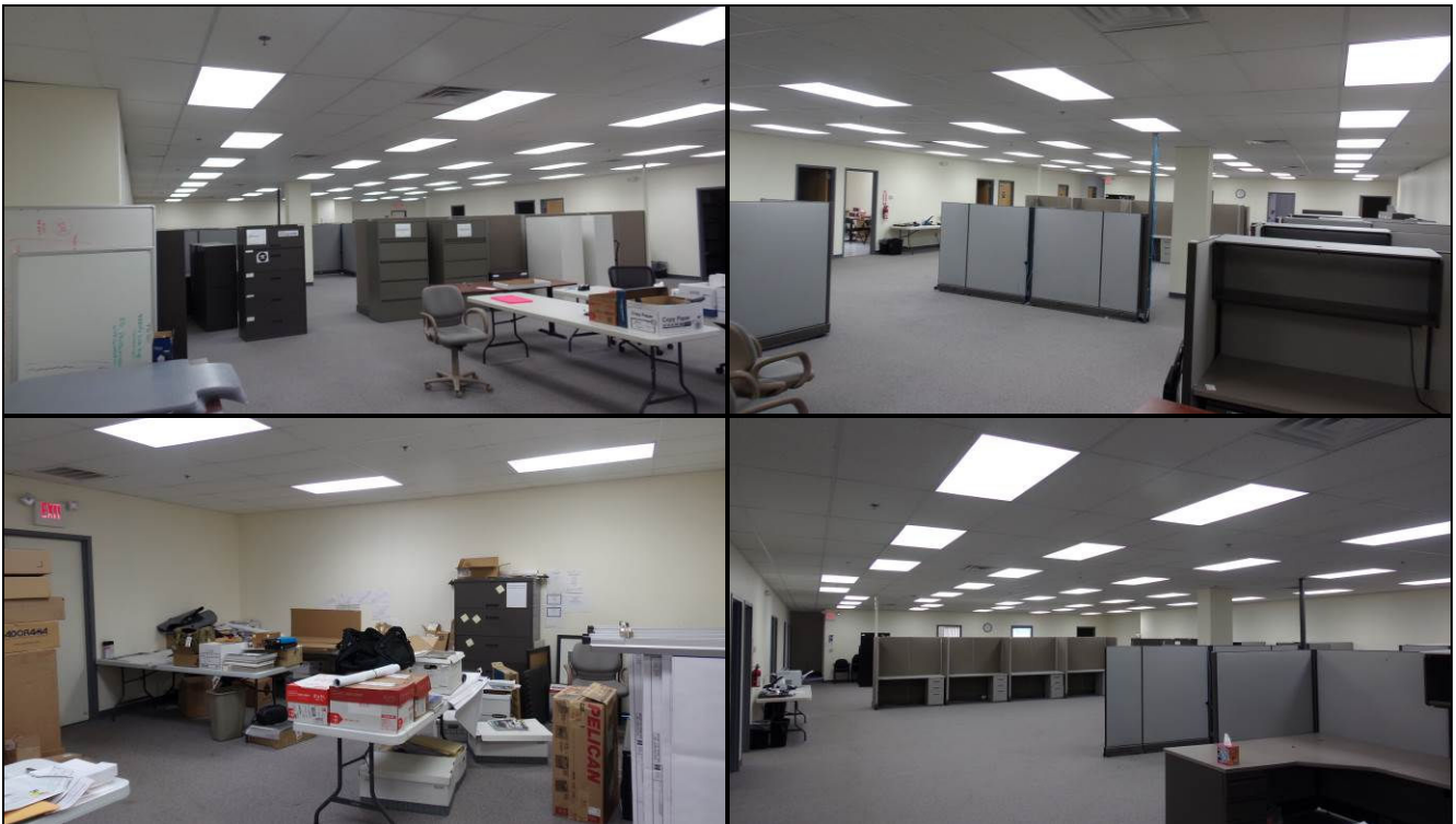
Figure 9 – Open Office Area