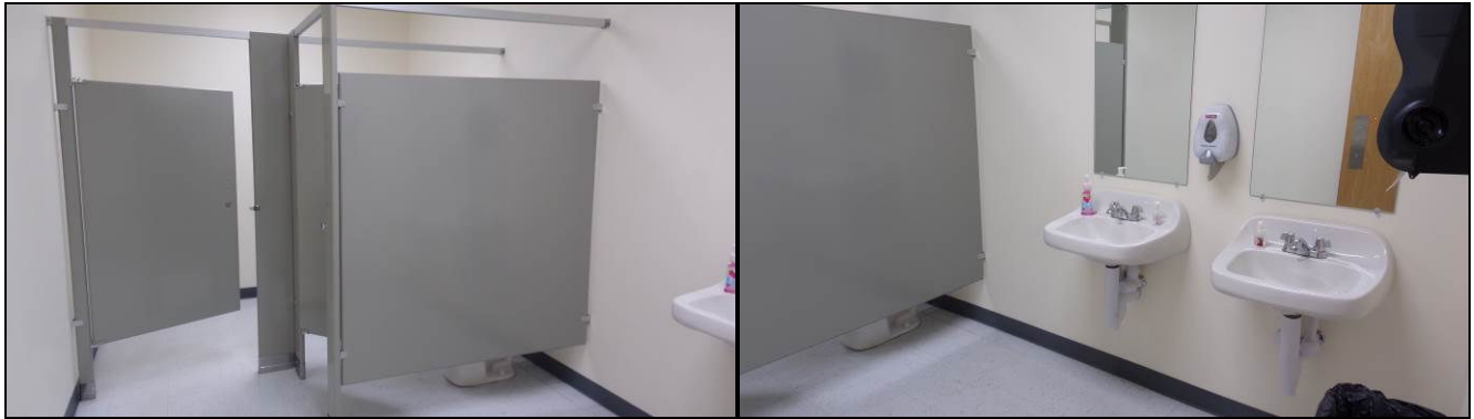
Figure 11 – Restrooms