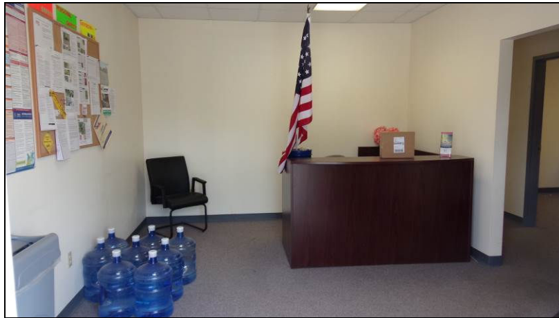
Figure 7 – Reception