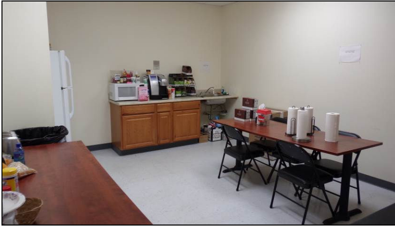
Figure 10 – Break room