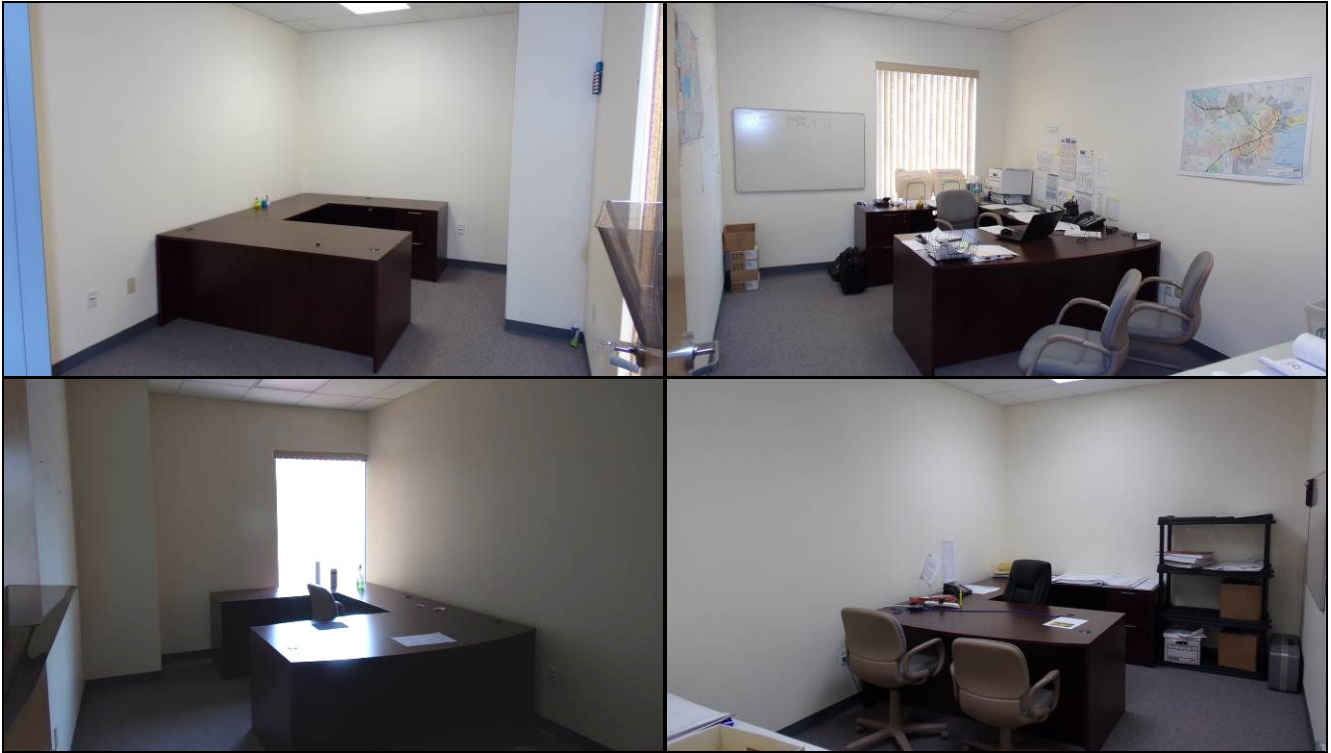
Figure 8 – Offices