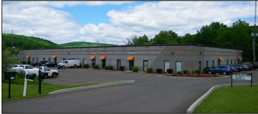
Figure 5 – Western (front) elevation