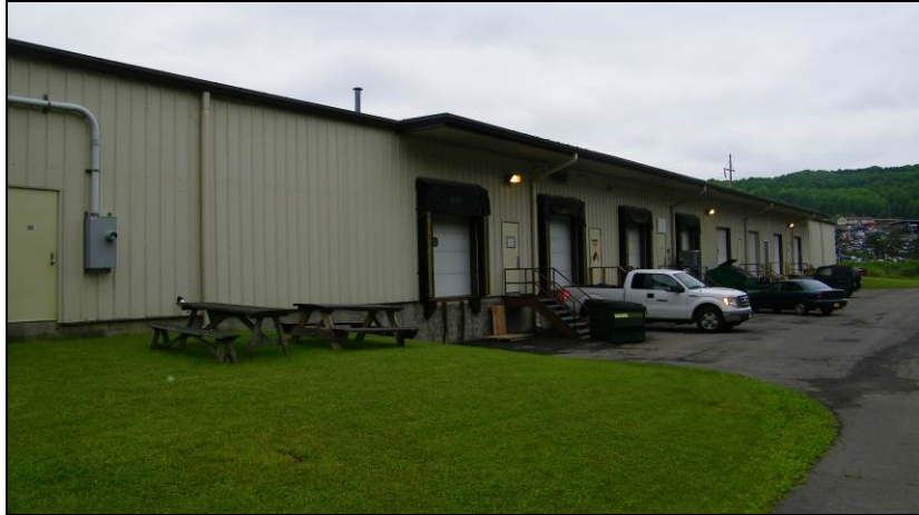
Figure 6 – Eastern (rear) elevation