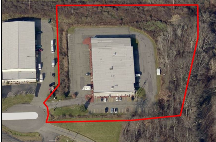
Figure 3 – Aerial photograph of the site (outlined in red)