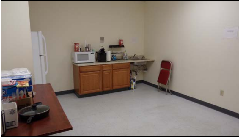
Figure 10 – Break room