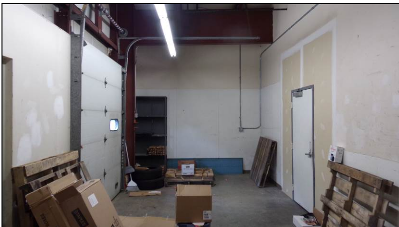
Figure 12 – Storage and dock area