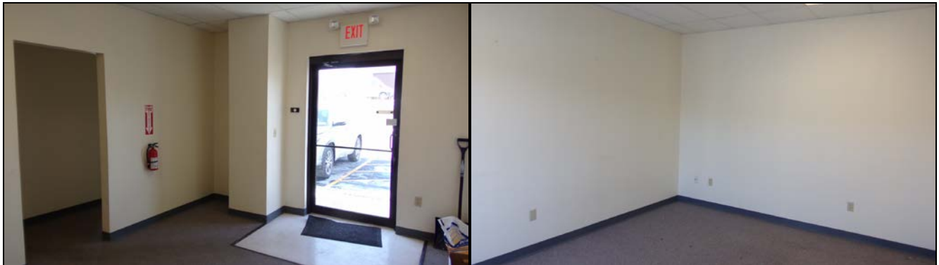
Figure 7 – Reception