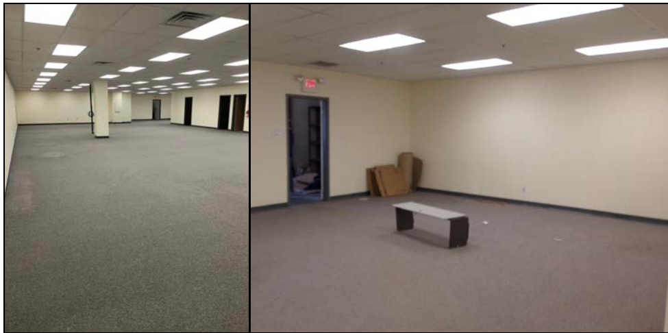
Figure 9 – Open Office Area