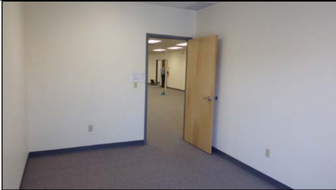
Figure 8 – Offices