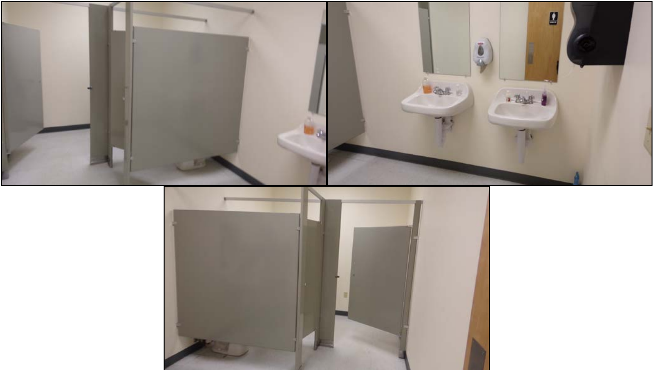
Figure 11 – Restrooms