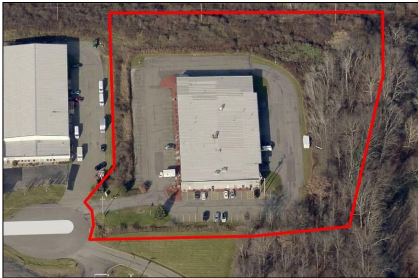
Figure 3 – Aerial photograph of the site (outlined in red)