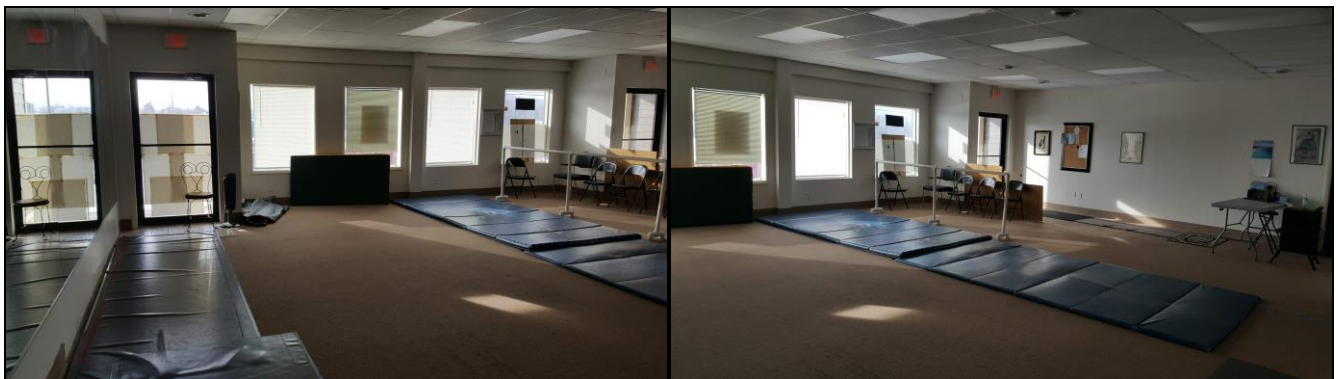
Figure 6 – Views of the interior