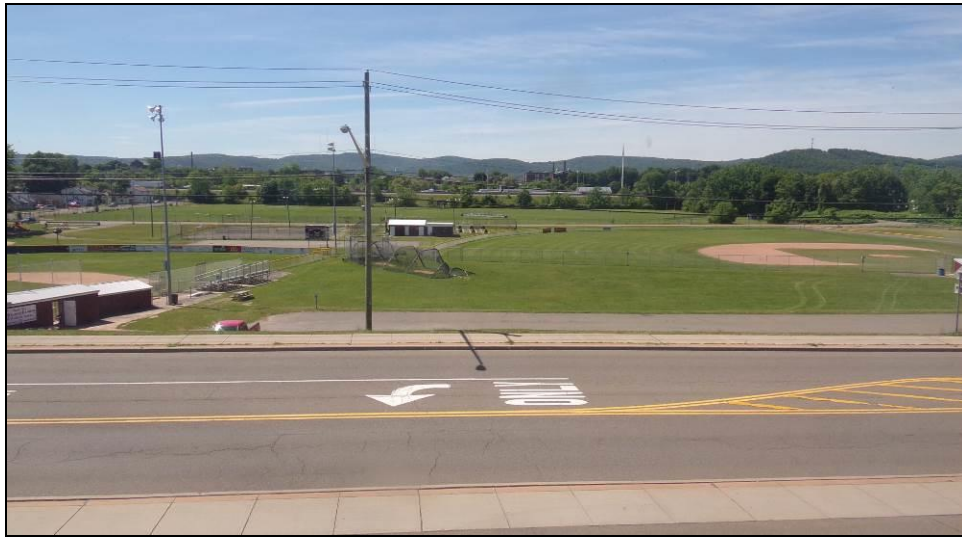
Figure 8 – View from interior front windows