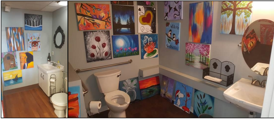
Figure 7 – Restrooms