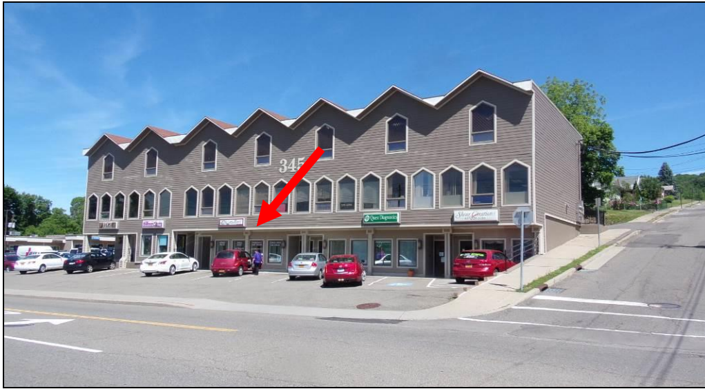
Figure 4 – Southern (front) and eastern elevations of the building (location of premises marked with arrow)