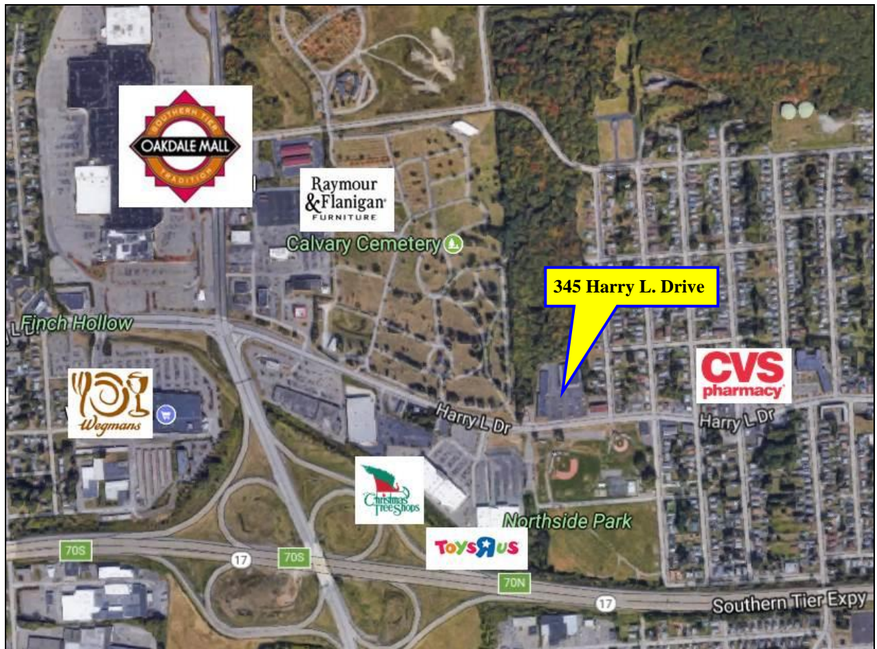
Figure 3 – Aerial photograph showing the surrounding buildings and tenancy