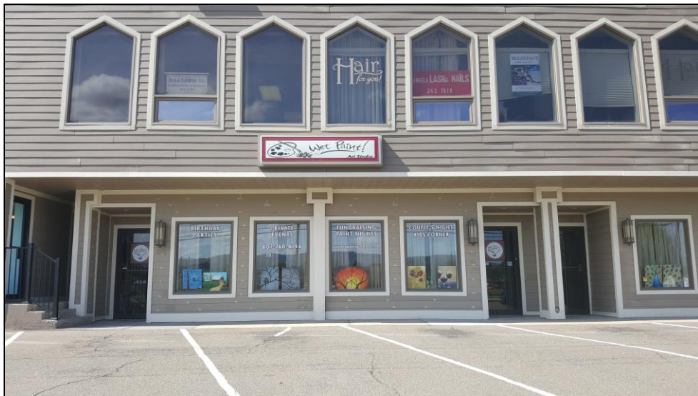
Figure 5 – View of the entrances