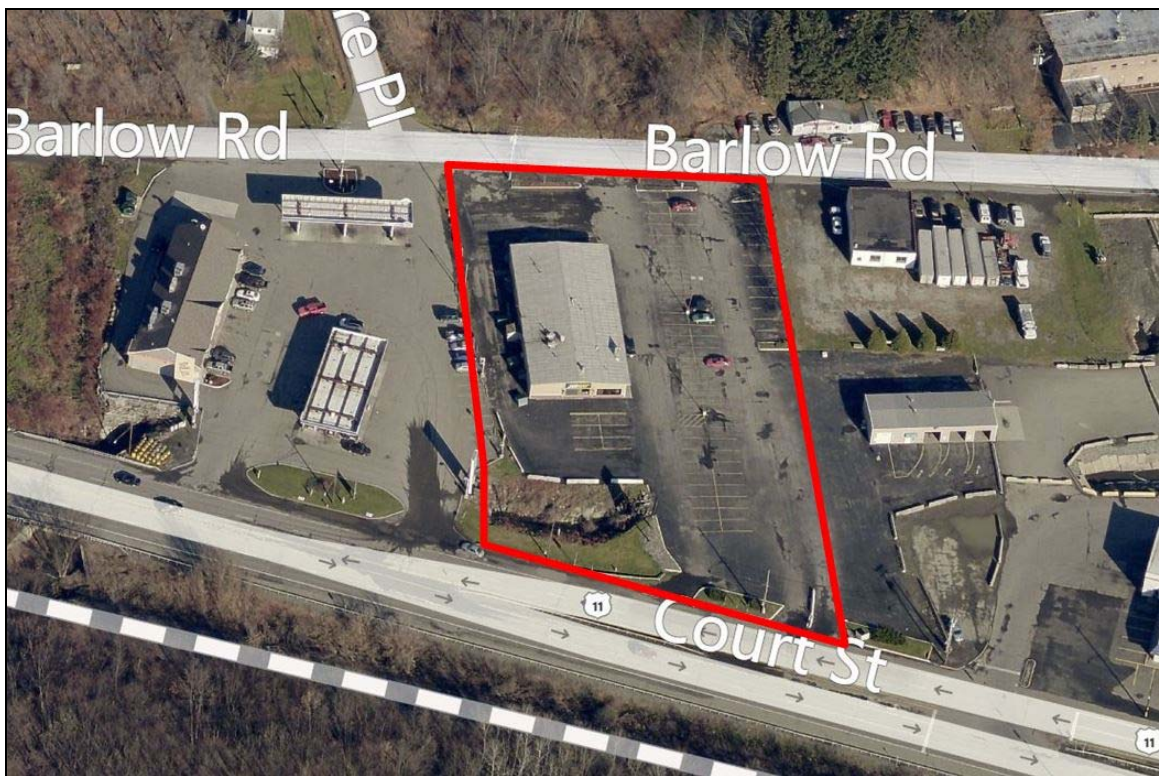
Figure 3 – Aerial photograph of the site (outlined in red)