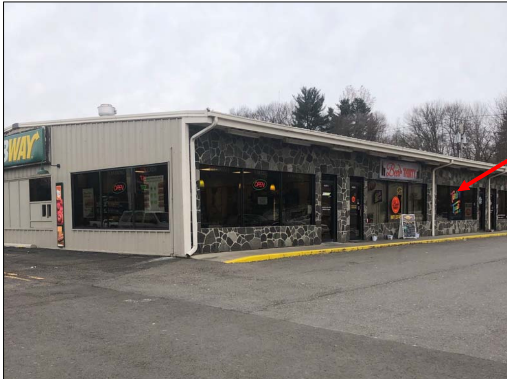
Figure 5 – Southern (side) and eastern (front) elevations of the building (from Upper Court Street)