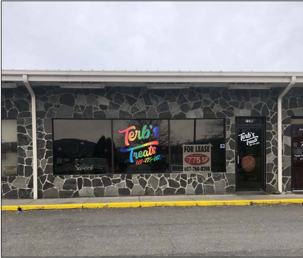
Figure 6 – Front of the available space