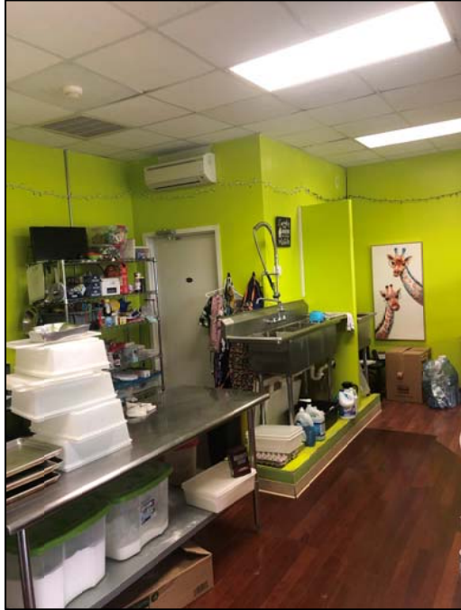
Figure 7 – Open work area