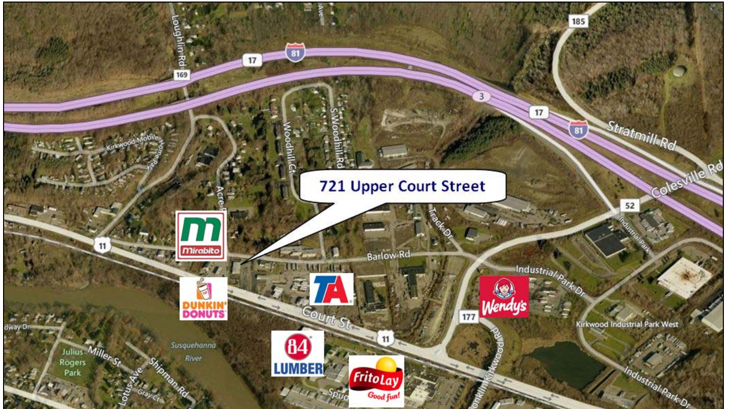
Figure 2 – Aerial photograph of the immediate neighborhood