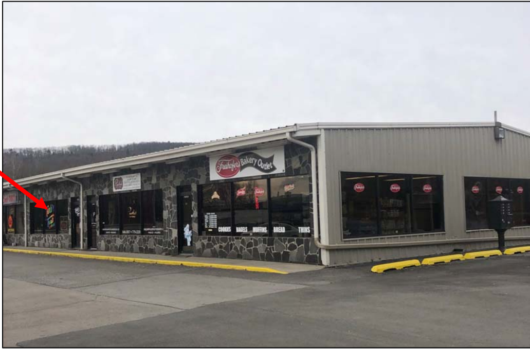
Figure 4 – Northern (side) and eastern (front) elevation of the building (from Barlow Road)