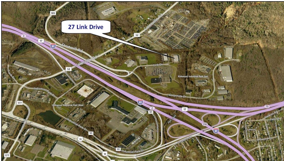
Figure 4 – Aerial photograph showing the proximity to Interstate 81 and the interchange ramp