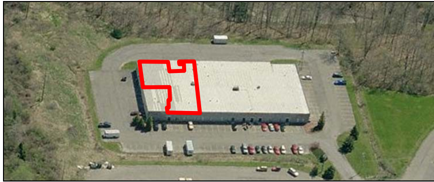
Figure 2 – Western (front) elevation