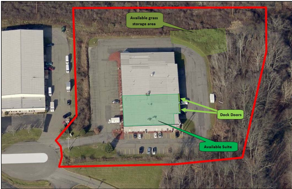
Figure 3 – Aerial photograph of available suite