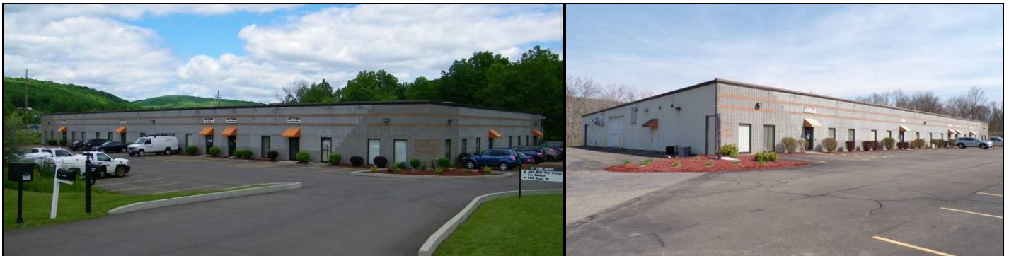
Figure 5 – Western (front) elevation