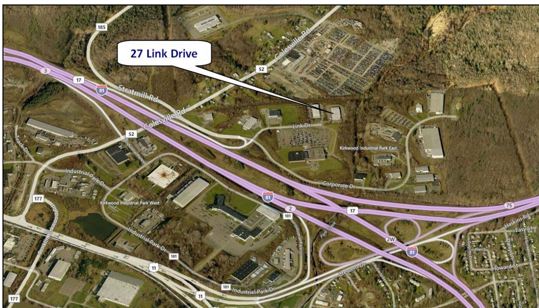
Figure 4 – Aerial photograph showing the proximity to Interstates 81 and 86 and the interchange ramps