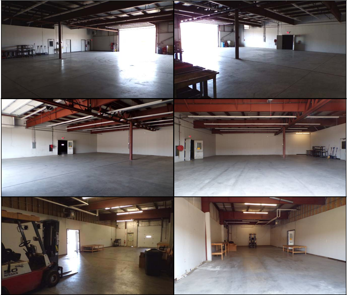
Figure 7 – Views of the open shop/warehouse areas