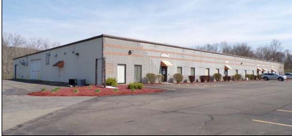
Figure 5 – Western (front) elevation