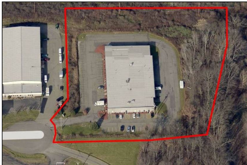
Figure 3 – Aerial photograph of the site (outlined in red)