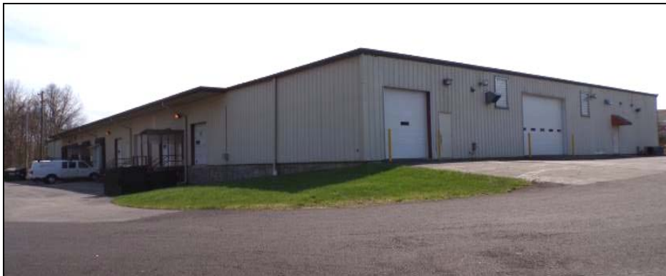
Figure 6 – Northern and eastern (side and rear) elevations