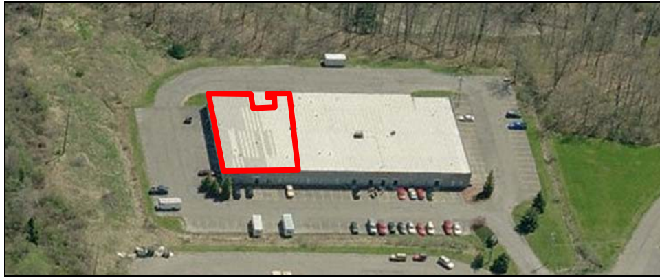
Figure 2 – Western (front) elevation