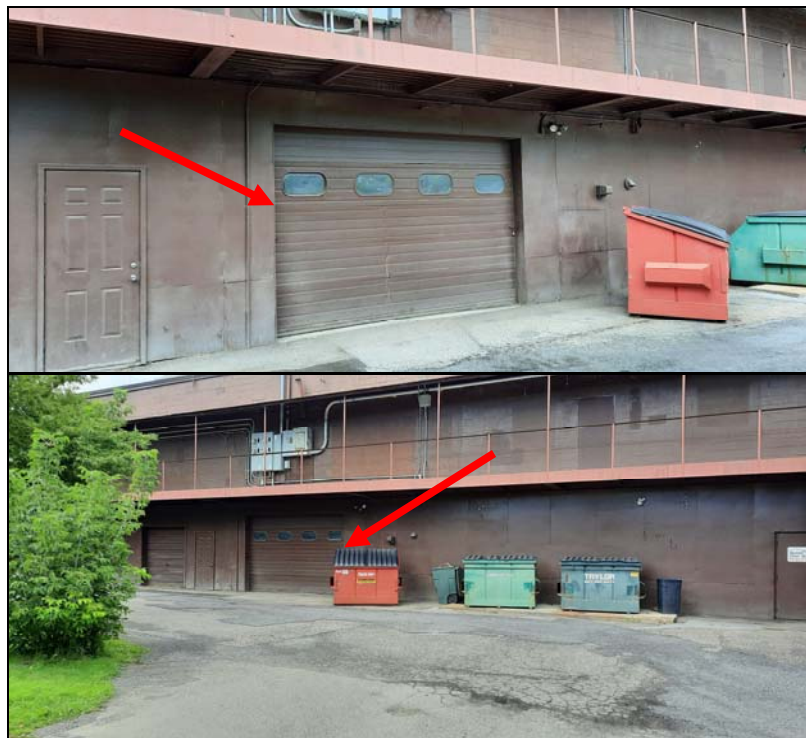
Figure 3 – Location of the storage suite