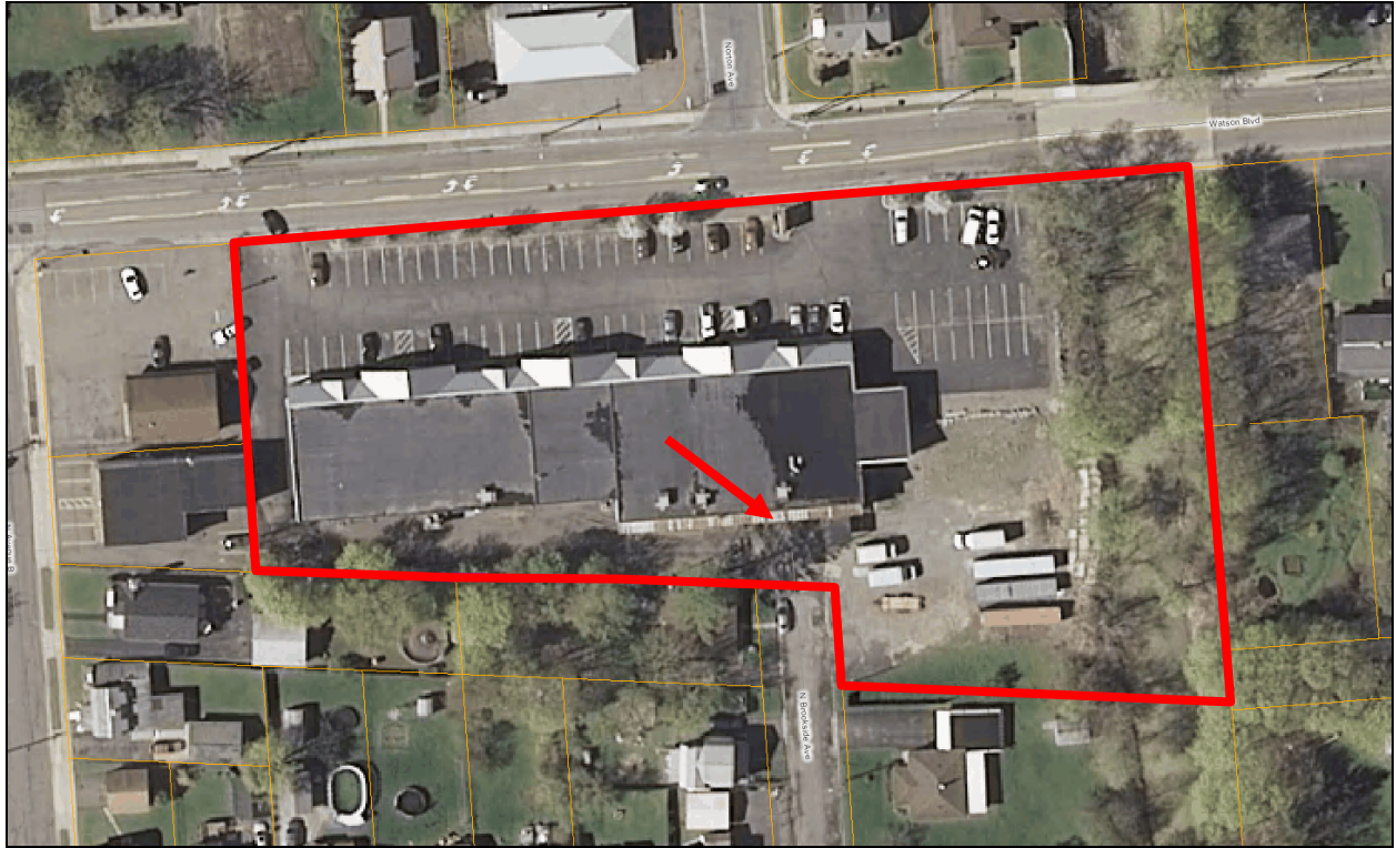
Figure 2 – Aerial photograph of the site